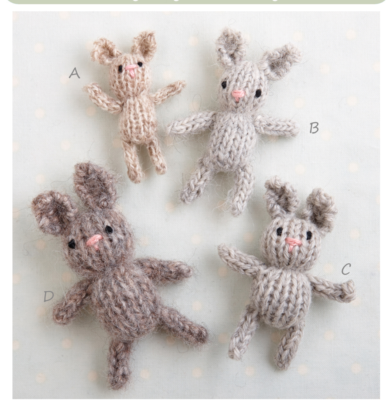
A: 6cm/2½ inches tall, Jamiesons Spindrift in 114 Mooskit on 2.25mm needles B: 7.5cm/3 inches tall, Lettlopi in 054 light Ash Heather on 2.75mm needles C: 8cm/3½ inches tall, Cascade 200 in 8011 Aspen Heather on 3mm needles D: 9.5cm/4 inches tall, Camarose Snefnug in 7360 Stengra in 3.5mm needles

Other knitting patterns are available at https://littlecottonrabbits.typepad.co.uk